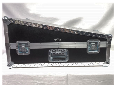
DP Vaults are designed to transport the instrument in a gig bag.

Music directors absolutely love Unitec Diamond Plate MULTI – CASES. Our double duty multi cases can be set in the band room and used for storage all year long. When the band hits the road you simply put the doors on and roll out. Multi cases feature numbered storage compartments for each band member. Multi cases take less space, organize the band and save hours of on and off load time.