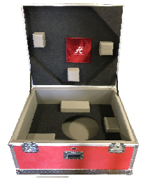
Diamond Plate DP-SOUS

Full length Caster Board - 4" Blueline Caster Board. EZ to move and roll over any surface.