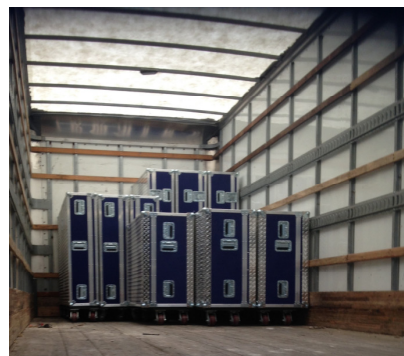
Multi-Cases enable you to transport the whole band using less space and effort.

Please call Unitec for courteous professional service