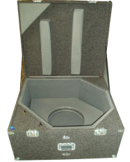
Road Tuff U-SOUS

Recessed Corner Casters - Exclusive from Unitec. Tilt back EZ roll caster design.