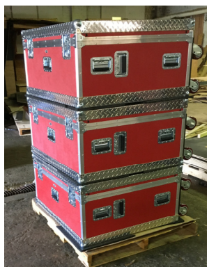
Unitec's Diamond Plate Sousaphone cases are stackable!